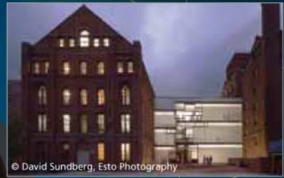
4. Central Wing School of Architecture (L, i) – Pratt Institute, 200 Willoughby Avenue, Brooklyn. Lighting: Arc Light Design

Space does not permit us to include complete descriptions of every project that have contributed to NYC's spectacular nighttime skyline. This guide instead captures the highlights, profiling those buildings and monuments that inspire the inevitable question as night descends and light transforms the cityscape... "What building is that?"