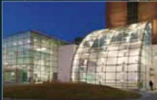
1. West Midtown Ferry Terminal – West 39th and West Side Highway. Lighting: Domingo Gonzalez Associates