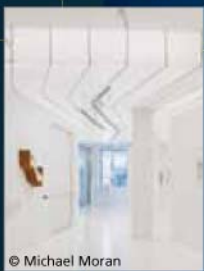
2. Mixed Greens Gallery (L, i) – 531 W 26th Street between 10th and 11th Avenue. Lighting: Tillotson Design Associates