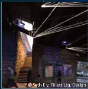
3. This Way (i) – East end of Brooklyn Bridge, Cadman Plaza East and Prospect St., Brooklyn. Lighting: Tillett Lighting Design